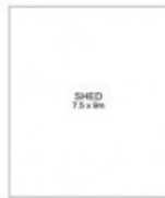
SHED 7.5 x 9m